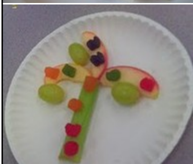
Chicka Chicka Boom Boom

The entry can be a visual representation that will be easily associated with the book.