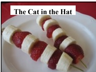
The Cat in the Hat

Entries can depict characters from the book.