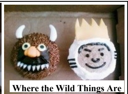
Where the Wild Things Are

Entries can depict characters from the book.