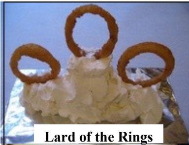
Lard of the Rings