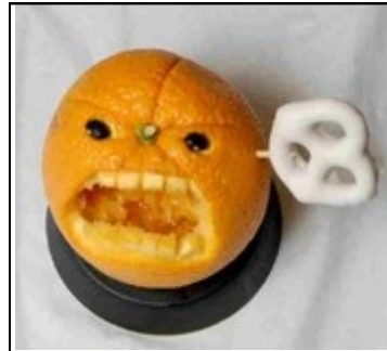
A Clockwork Orange

Verbal or visual puns can make good entries.